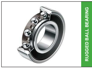
RUGGED BALL BEARING

Rugged Ball bearing design capable of handling high ambient conditions and excessive radial and axial loading.